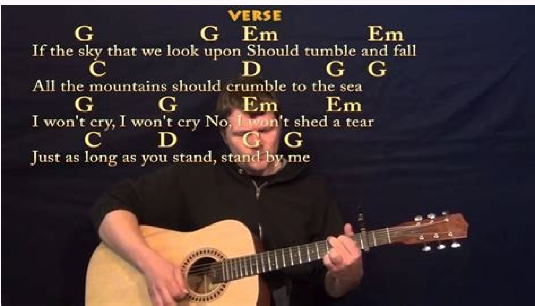
Imagine from www.traditionalmusic.co.uk

Imagine there's no heaven It's easy if you try No hell below us Above us only sky Imagine all the people Living for today Imagine there's no countries It isn't hard to do Nothing to kill or die for And no religion too Imagine all the people Living in peace You may say I'm a dreamer But I'm not the only one I hope someday you'll join us And the world will be one Imagine no possessions I wonder if you can No need for greed nor hunger A brotherhood of man Imagine all the people Sharing all the world You may say I'm a dreamer But I'm not the only one I hope someday you'll join us And the world will live as one