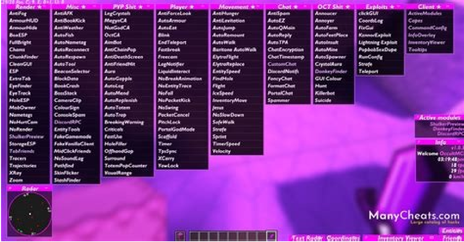
Minecraft hack version 1.15.2 download. Hacked version minecraft. Minecraft hack version 1.18.2.03. Minecraft hacked version 1.16.4 download. Minecraft hack version 1.19. Minecraft hack version unlimited everything. Minecraft hacked version 1.17. Minecraft hack version god mod.